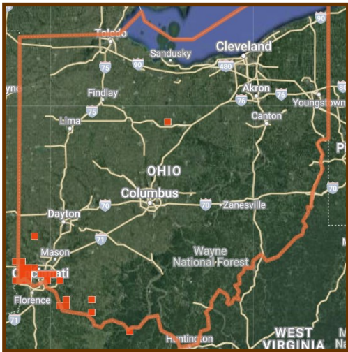
This map, taken from iNaturalist, shows the Eastern Velvet Ant's distribution in Ohio. Our record is the only one north of Dayton.

The tropical looking Eastern Velvet Ant is actually a wasp with a powerful sting. (Velvet ants are so named because females are wingless, resembling their close relatives, ants.) Also known as the “Cow Killer”, the pain from their sting is purportedly intense enough to kill a cow. While this is an exaggeration, they do possess the fourth most powerful sting, which is delivered by the longest stinger relative to body size of all insects! Velvet ant stings are rare, however, due to their solitary lifestyle. This species is uncommon in Ohio and is typically found only in the southern part of the state close to the Ohio River. Northerly records of the Eastern Velvet Ant on iNaturalist, a database of citizen observations, in the United States are scarce. A handful have been reported but only within the last two years. Perhaps climate change is having an impact on their northern range expansion. CPD Land Manager, Kyle Bailey, was lucky enough to spot this one crossing the sidewalk outside of the Nature Center during his August butterfly hike!